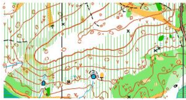
IOF Lagland – Aspérolange - 1/10.000 – contour interval 2,5m - 2009.